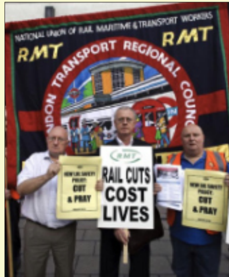
RMT struggle against cuts led them to challenge Blair in the London elections

There are differences between a revolutionary Marxist party, and, a workers' party that is a broad alliance or united front of various anti-capitalist trends. The strategical aim of the ISL is the building of a